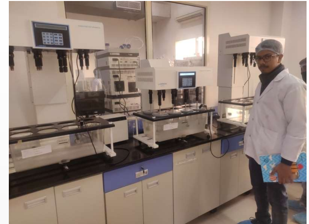
Dissolution Test Apparatus